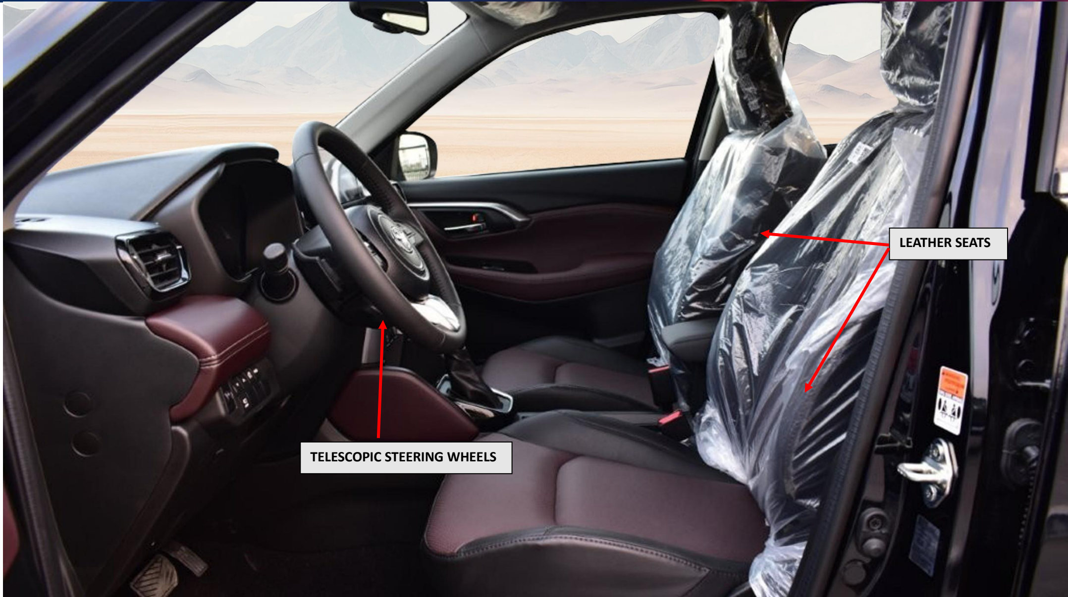
TELESCOPIC STEERING WHEELS